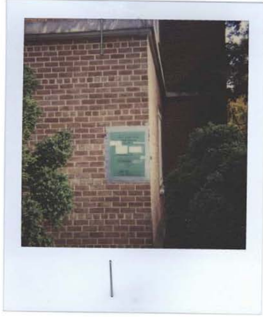
13. 10/22/02 - Replace One Revised Sign, 5400 Block Military Road & Western Avenue, NW