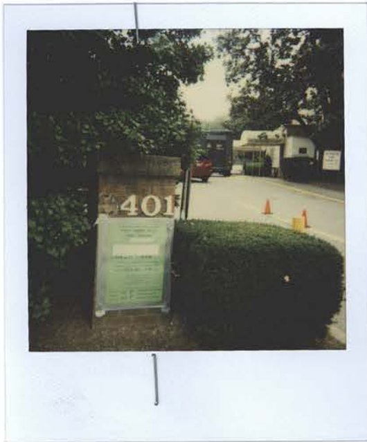
3. 10/4/02 – Replaced one sign - 5401 Western Avenue, NW