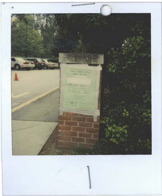
1. 10/4/02 – Replaced one sign – 5401 Western Avenue, NW