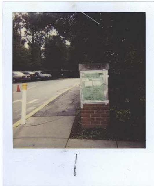
8. 10/14/02 – Replaced one revised sign – 5401 Western Avenue, NW