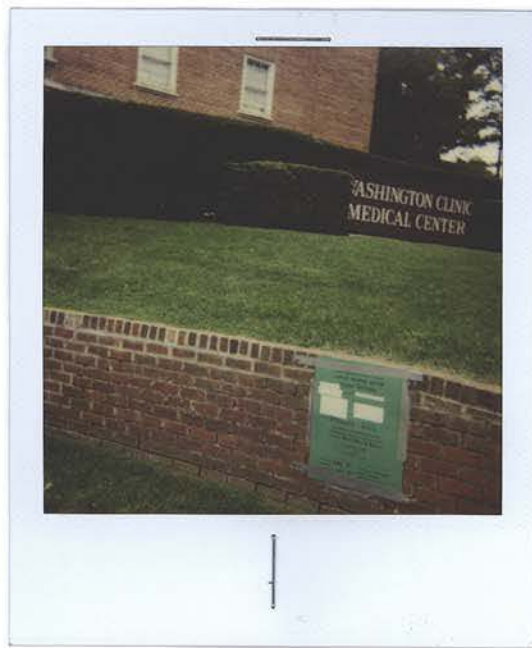
6. 10/9/02 – Revised and replaced one sign – 5400 Block Military Road & Western Avenue, NW