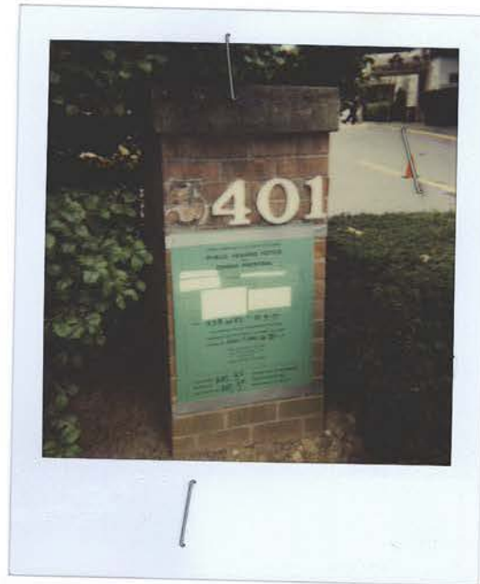
4. 10/9/02 – Revised and replaced one sign – 5401 Western Avenue, NW