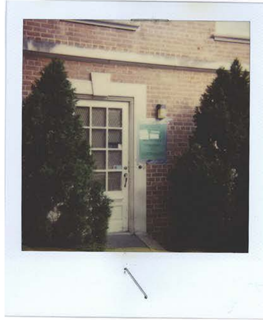
9. 10/14/02 – Replaced one revised sign - 5400 Block Military Road & Western Avenue, NW