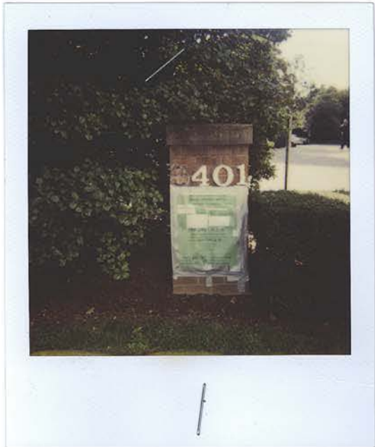
7. 10/14/02 – Replaced one revised sign – 5401 Western Avenue, NW