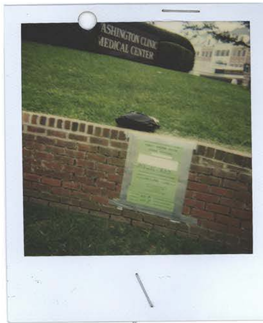
2. 10/4/02 – Replaced one sign 5400 Block Military Road & Western Avenue, NW