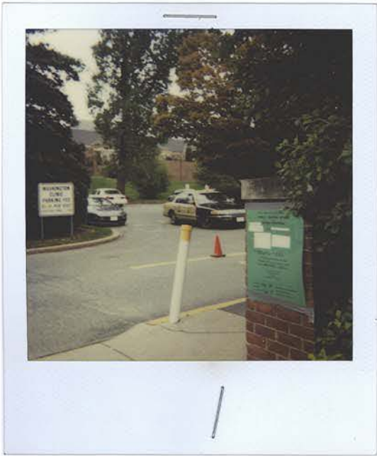
5. 10/9/02 – Revised and replaced one sign – 5401 Western Avenue, NW