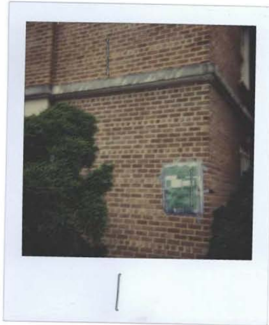
15. 10/28/02- Replaced One Revised Sign - 5400 Block Military Road & Western Avenue, NW